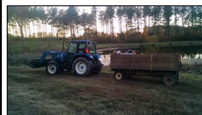
HSFM Annual Hayride Nov. 9, 2019