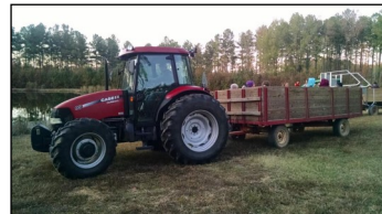
HSFM Annual Hayride Nov. 9, 2019

"Go therefore and make disciples of all nations..." Matthew 28:19