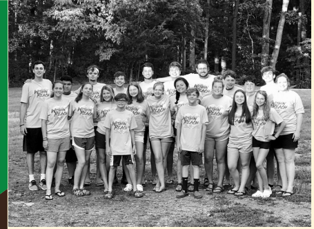
WITHIN REACH Team 2019

GOAL: Successfully complete local service projects in and around our area to positively impact the lives of those WITHIN REACH of the community as well as exposing students to local ministries to serve in the future.